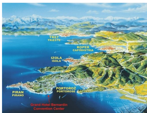
Panorama of the Slovene coast