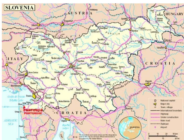
Map of Slovenia